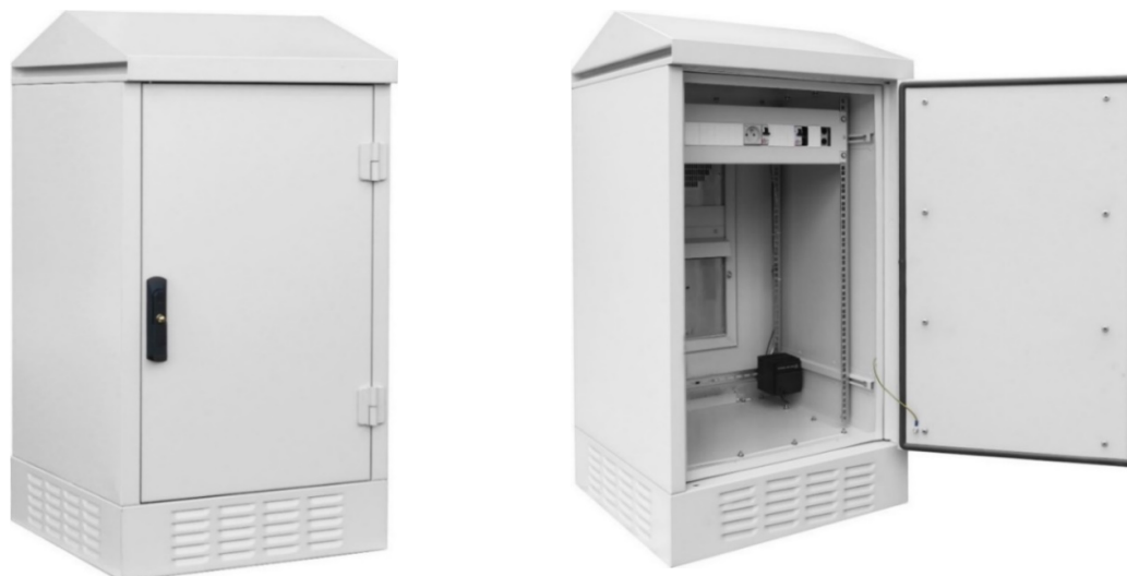
SZK-18U z klimatizatorem